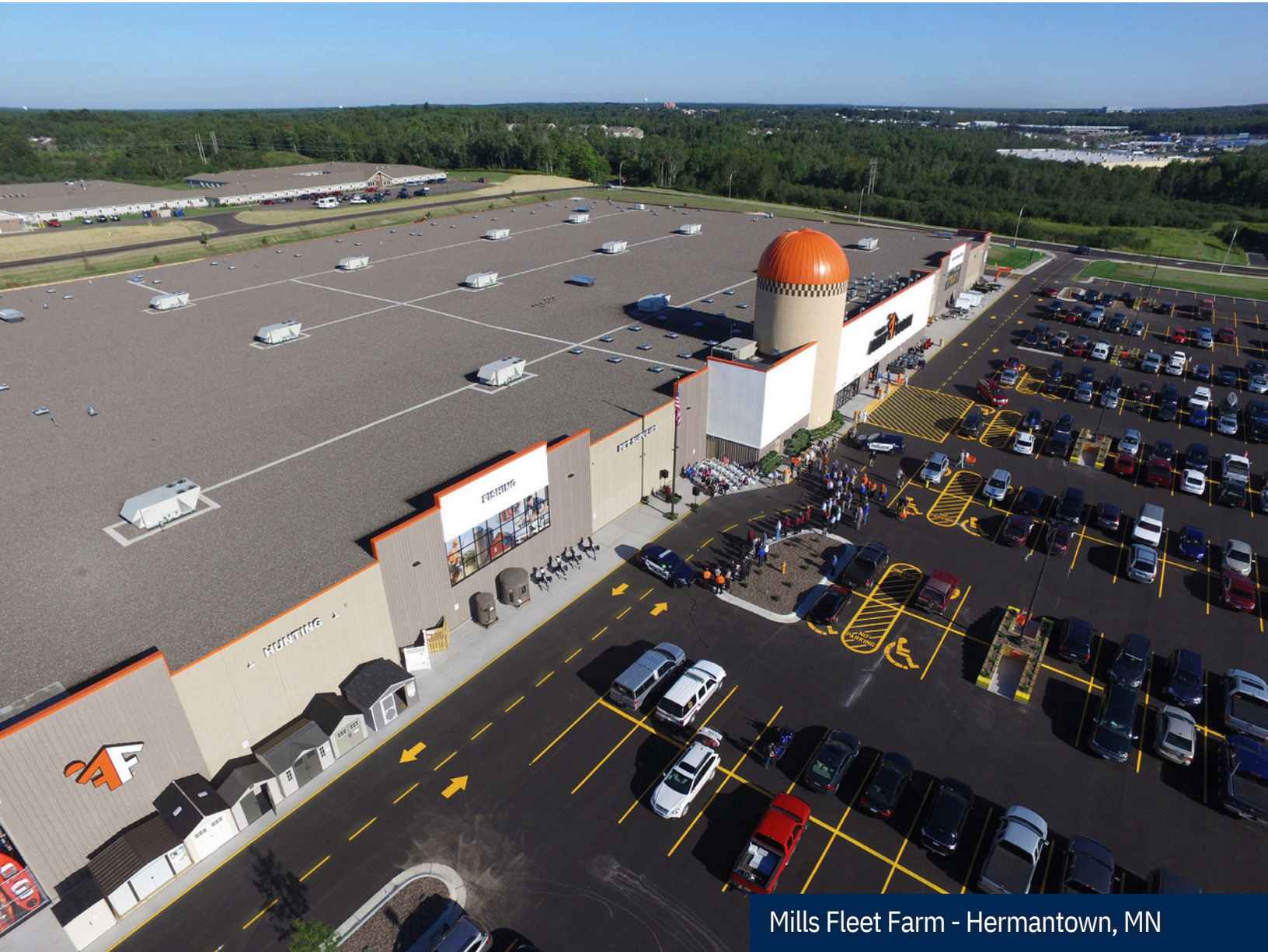
Mills Fleet Farm - Hermantown, MN

ARCHITECTS ■ ENGINEERS ■ SCIENTISTS ■ SURVEYORS